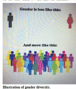
Illustration of gender diversity.