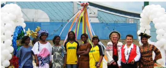
Left: Parade Float

Special thank you goes out to our numerous Sponsors, Board of Directors, Group Members, Festival Assistant, and volunteers who helped with all the duties needed to make Motif 2009 another great success.