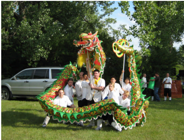
Above: Chung Wah Kung Fu

Motif, July 10, 11, 12, 2009 was the 35th Anniversary and another huge success. Motif 2009 boasted 14 different Ethnic backgrounds with delectable food and magnificent artifacts from all native lands. Our three headliners this year were the Caribe Steel Orchestra, Crofter's Revenge, and Chung Wah Kung Fu. All three performances captivated the audience with their ethnic sounds ranging from the far off lands of the Caribbean to the mythical creations of China.