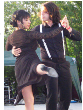
Right: Latin American Dancers