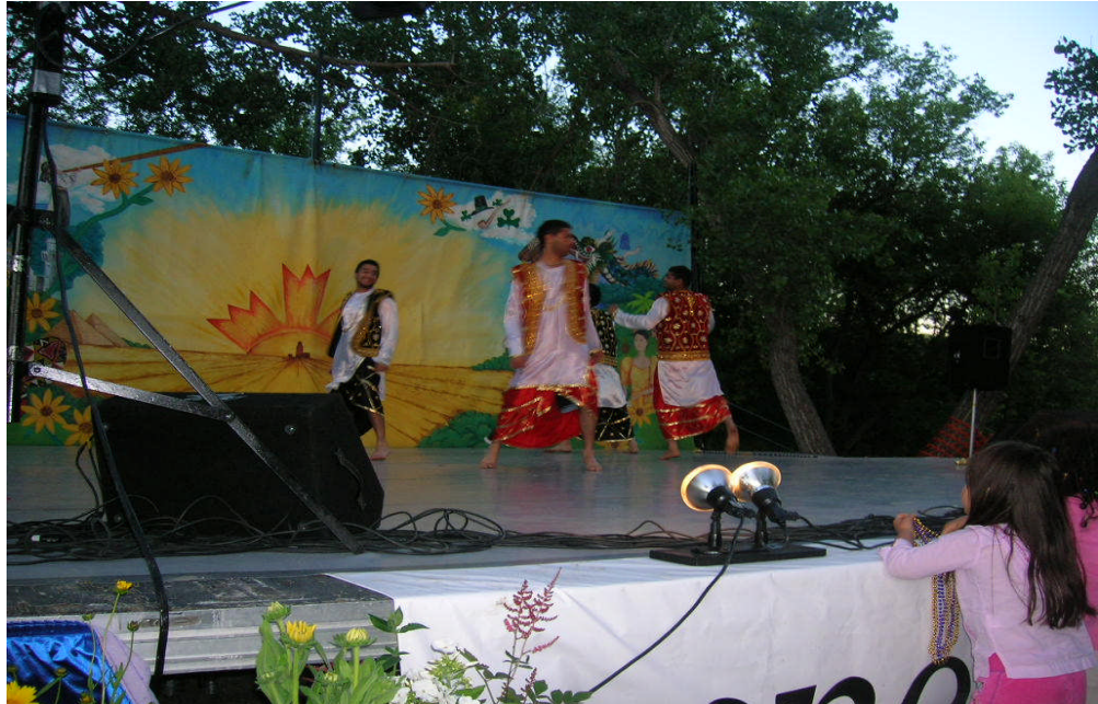
Above are the Punjabi Bhang dancers, who performed both Friday and Saturday.

July 11th, 12th, and 13th the Moose Jaw Multicultural Council Hosted the 34th Annual Motif Festival. Even through the rain and wind we had for Friday night performances everyone's spirit and drive were there and the festival went on. Our two main headliners were Bandja on Friday night, and Louisiana Jane on Saturday night, both blew the crowds out of the water! A traditional mix of African and Cajun was brought to us, the sound of music Motif was looking for. Along with several group performers who were exceptional in their cultural dress and dance. They received a heartwarming, (standing ovation) from the audience.